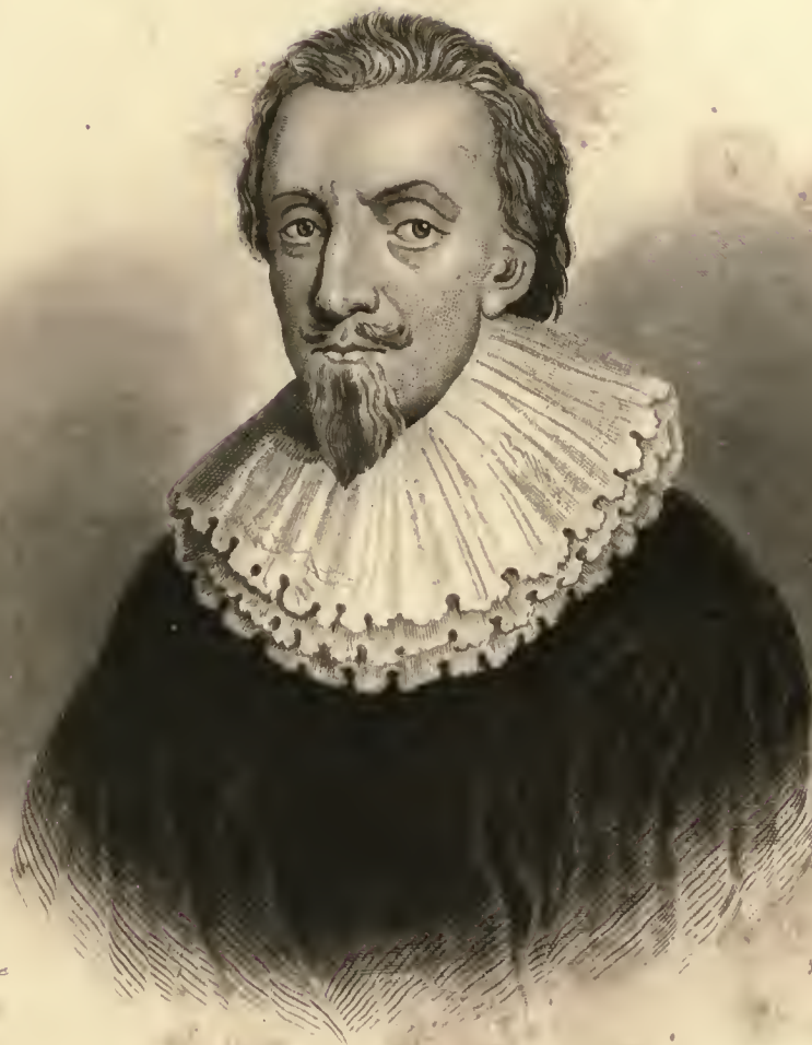
George Calvert. (First Lord Baltimore) after the painting by Mytens.